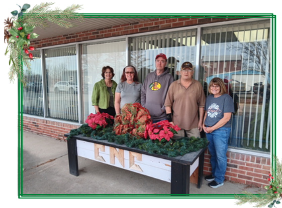
California Nutrition Center