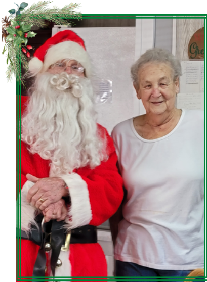
Glasgow Senior Center