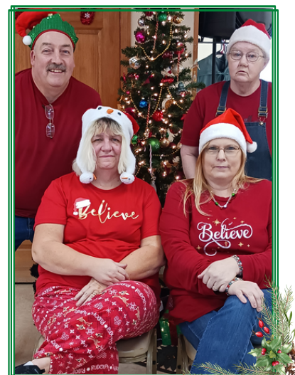
Cuba/Bourbon Senior Centers