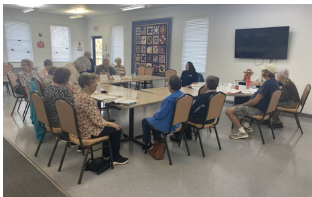
Participants in Osage Beach learn about fall prevention, strength & balance at a recent "A Matter of Balance" workshop.

traveling throughout our service area to bring a variety of programs to communities who would like to host.