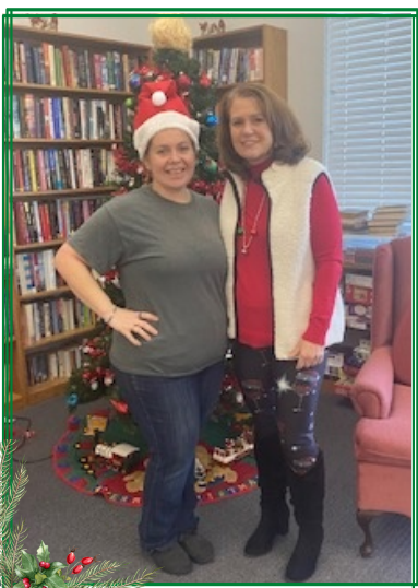
Osage Beach Senior Center