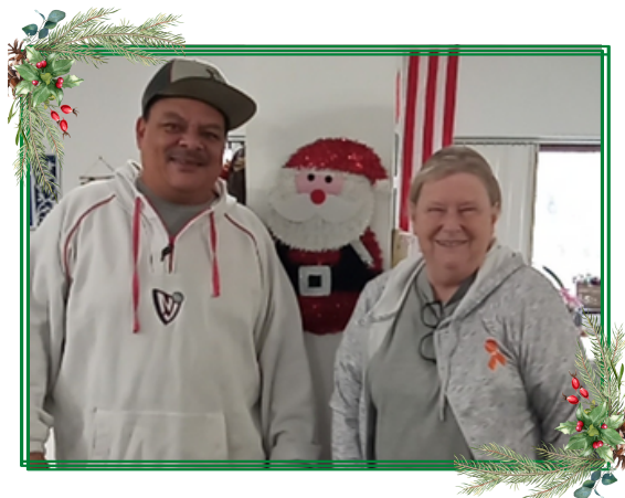
Ken Shaw & Joyce Blomberg Clark Senior Center