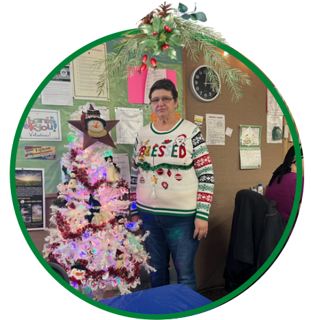
Moniteau Nutrition Center