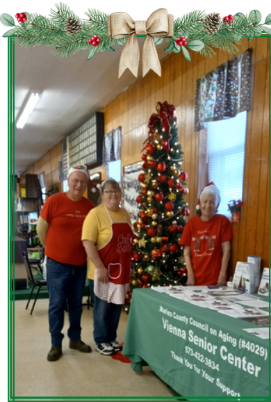
Vienna Senior Center