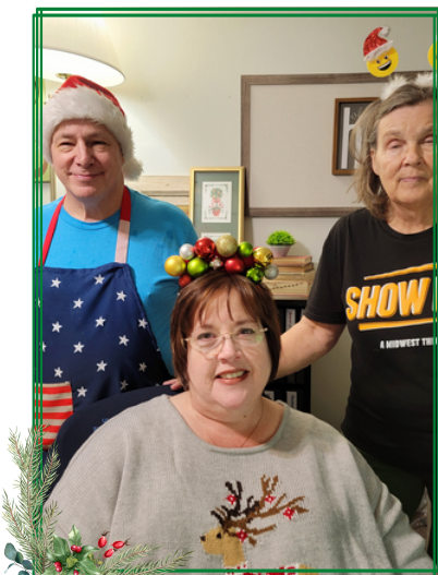
Fayette Senior Center