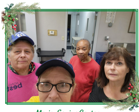
Mexico Senior Center