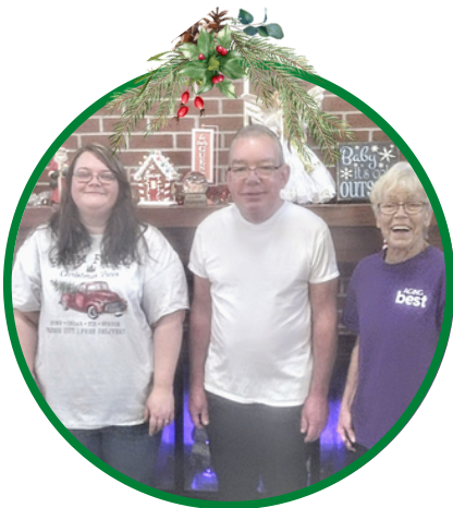
Hughes Senior Center