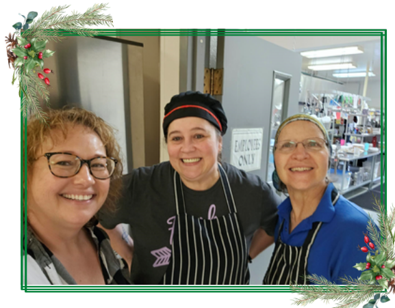
Salem Senior Center