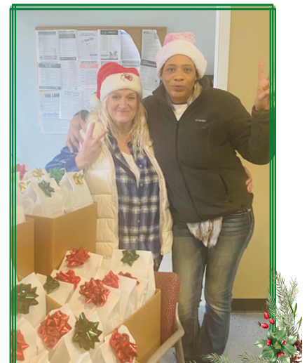
Boone Nutrition Program