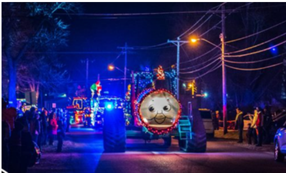
Guests line the street to watch the Lighted Tractor Parade in Centralia.

Local festivals and parades are a big draw. Though we enjoy them, we may take them for granted a bit. Large city parades often display elaborate floats and amazing lights, but they miss that small town, family feel that you get with the parades we have in Central Missouri. This is often what is shown in holiday movies, and the dream of seeing it in person is a huge draw. Midwestern hotels have reported a rise in holiday guests not only from warmer states but as far away as Asia, Australia and New Zealand.