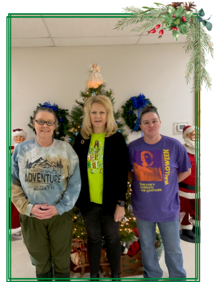
Sayers Senior Center