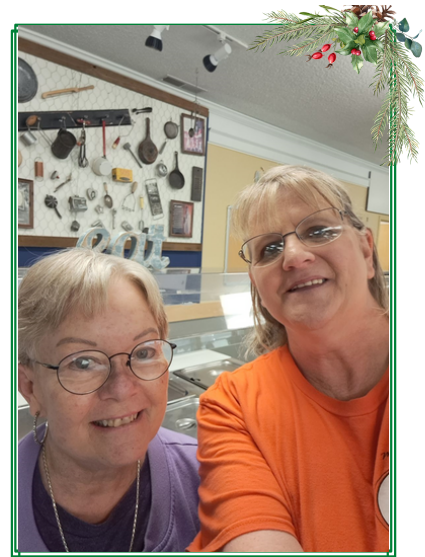
Boonslick Senior Center